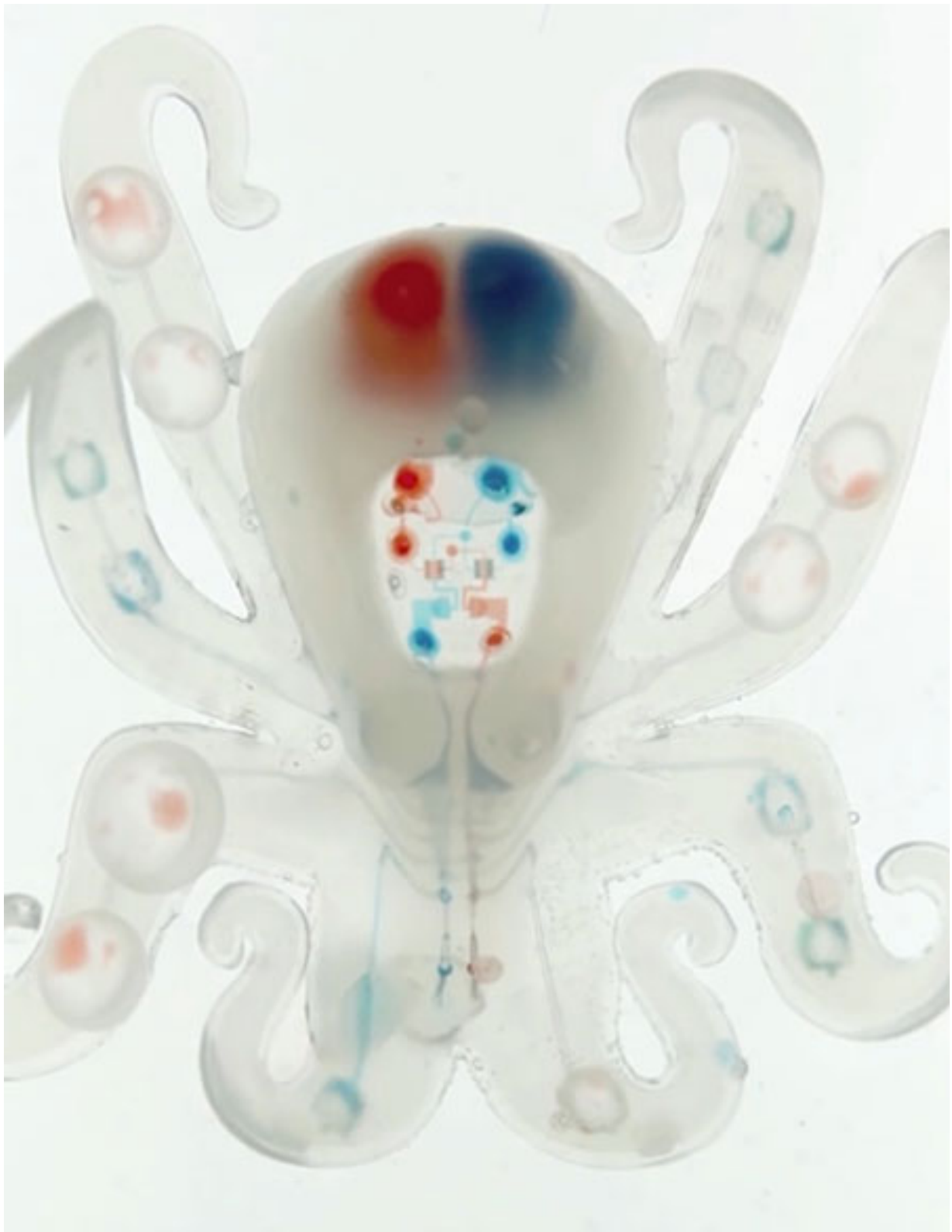
This squishy octopus-shaped machine is one example from the growing field of soft robotics. The Octobot described today is the first self-contained robot made exclusively of soft, flexible parts.