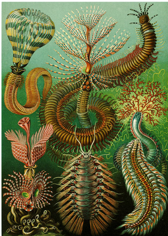
A depiction of invertebrates by German biologist Ernst Haeckel, published as lithographic and halftone prints in Art Forms in Nature (1899).