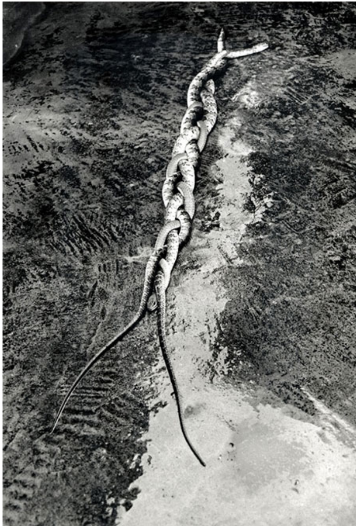
Tunga, From the series Vanguardia Viperina , 1985. Black and white photograph.

The terra-cotta figure of Potnia Theron, the Mistress of the Animals, depicts a winged